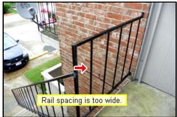
Site all rails