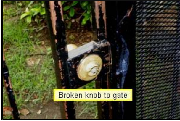
Broken knob to gate