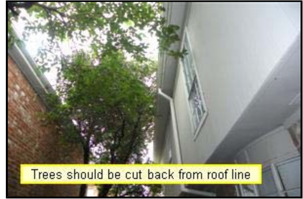
Trees should be cut back from roof line