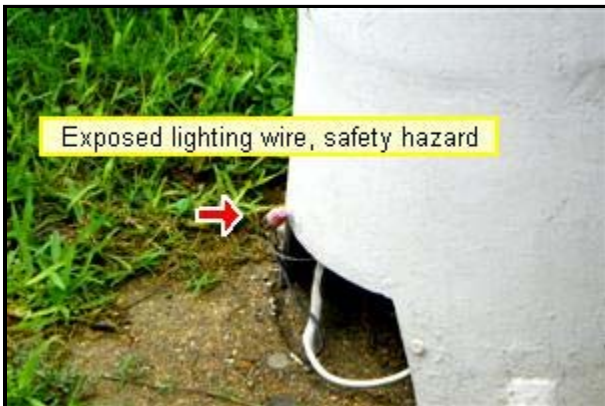
Site sidewalk and gate entrance