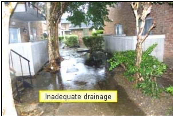
Site walk way thru units