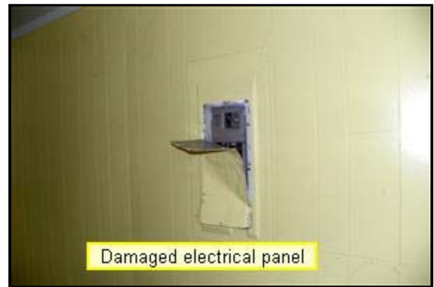
Damaged electrical panel