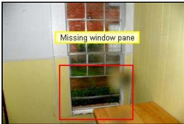
Site laundry room