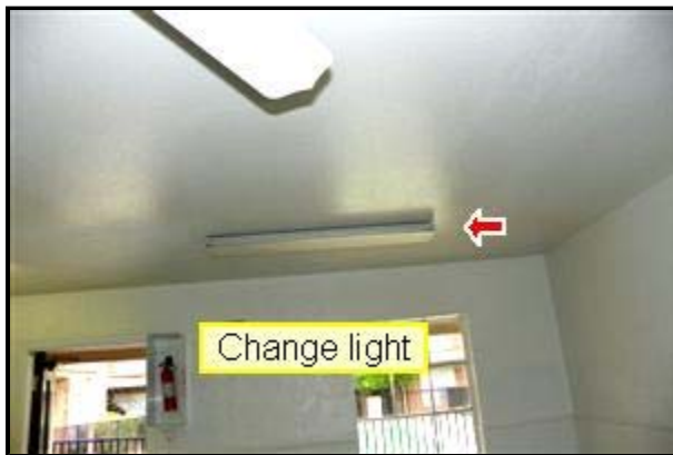
Site laundry room