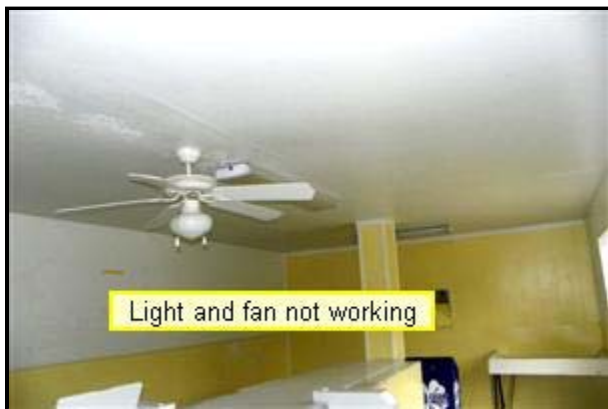
Light and fan not working