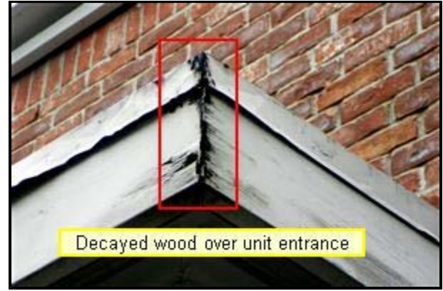
Decayed wood over unit entrance