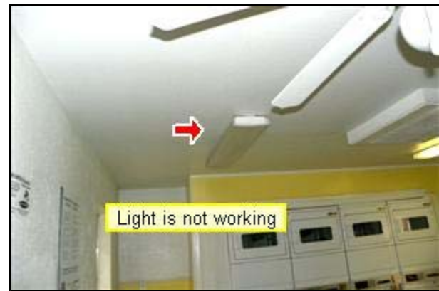
Site laundry room