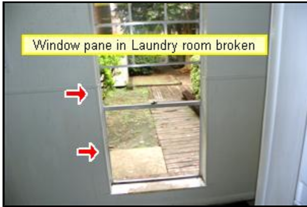
Site laundry room