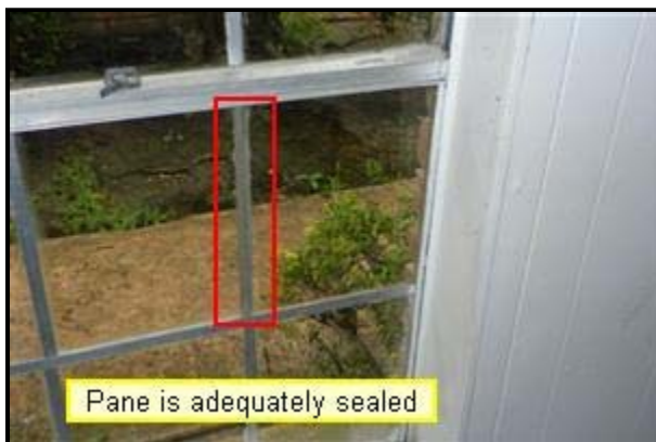
Site laundry room