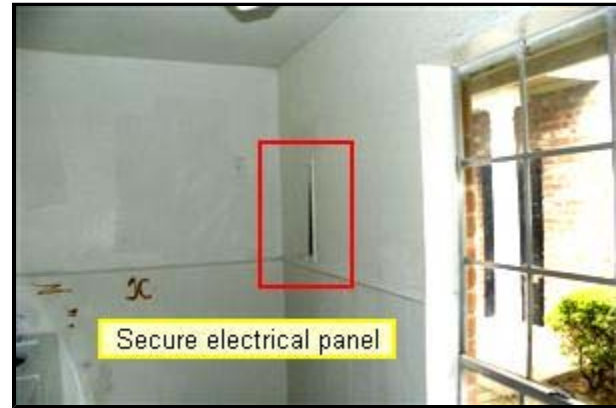
Site laundry room