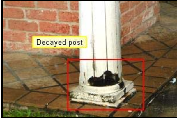
Site mailbox area