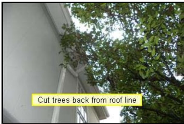
Cut trees back from roof line