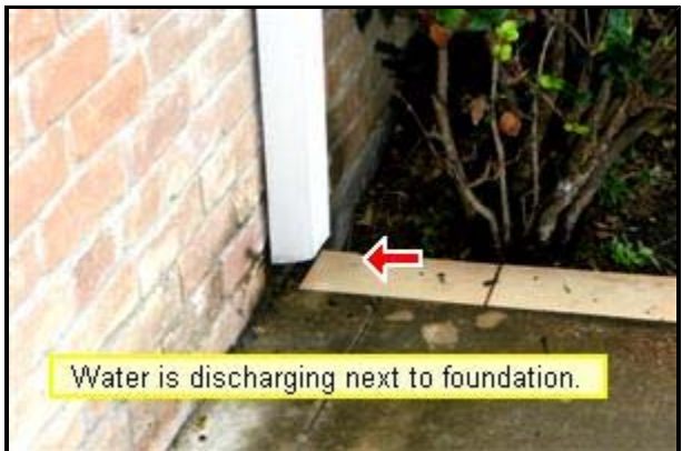
Site office front