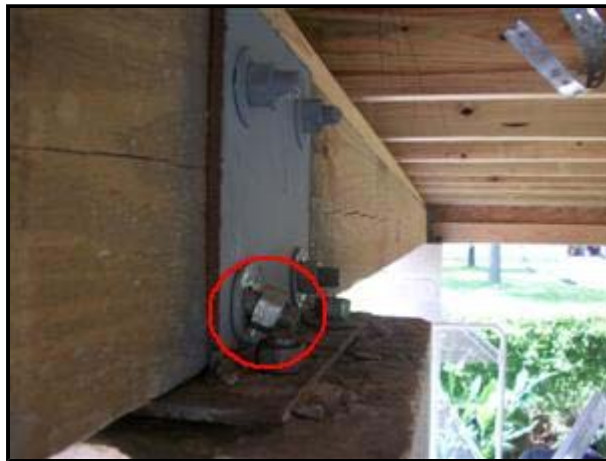
A. Picture 7

(5) Bolt at girder is not fully engaged at the rear middle pier.