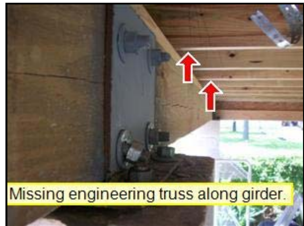
A. Picture 5

(4) There is no bracket at the rear piers. Also, the girder is not properly bolted into the pier. These bracket should be installed as per the engineered per design to ensure an even distribution of the load during windstorm conditions.