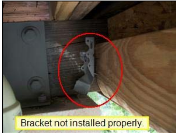
A. Picture 4