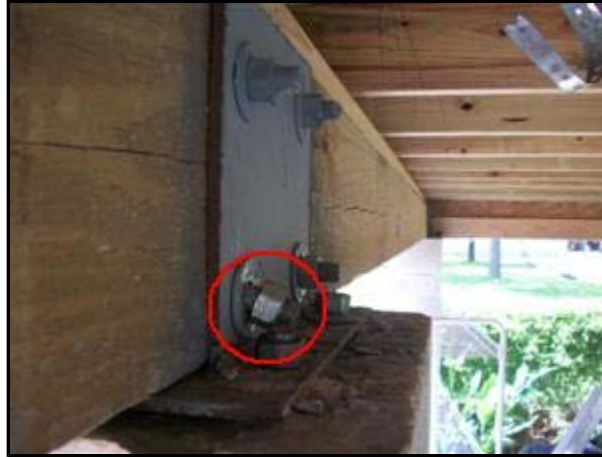
A. Picture 7

(6) The floor joist should not be located directly at the bracket. Also, the floor joist shows sign of deteriorated/rotting wood and should be replaced.