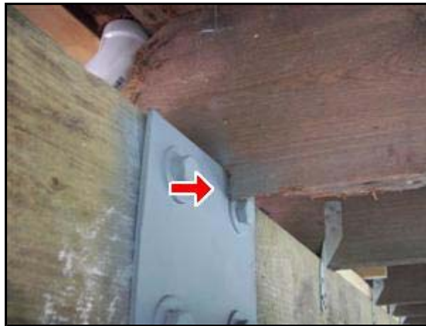
A. Picture 8

(6) The floor joist should not be located directly at the bracket. Also, the floor joist shows sign of deteriorated/rotting wood and should be replaced.