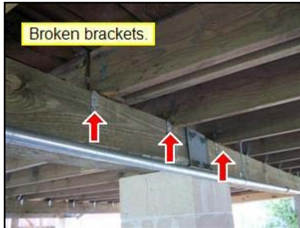
A. Picture 2

(3) Several engineering brackets are not properly installed throughout the floor joist and girder interface. They are either not completely engaged, missing or broken. These bracket should be replaced to ensure an even distribution of the load during windstorm conditions.