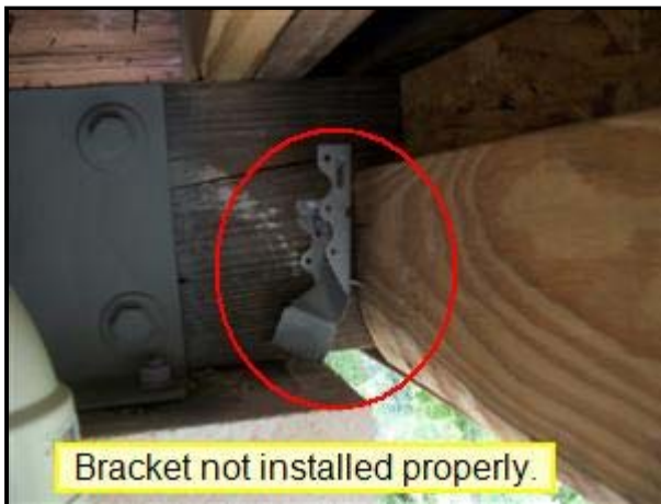
A. Picture 4