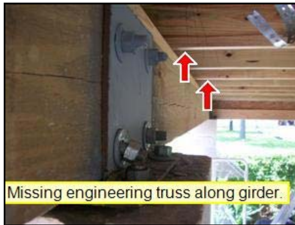
A. Picture 5

(4) There is no bracket at the rear piers. Also, the girder is not properly bolted into the pier. These bracket should be installed as per the engineered per design to ensure an even distribution of the load during windstorm conditions.