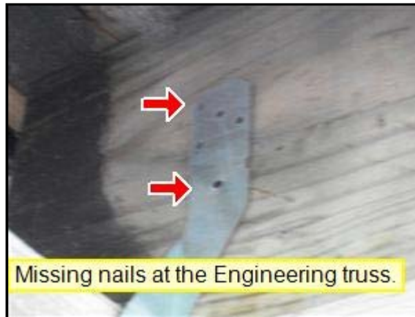
A. Picture 1

(3) Several engineering brackets are not properly installed throughout the floor joist and girder interface. They are either not completely engaged, missing or broken. These bracket should be replaced to ensure an even distribution of the load during windstorm conditions.