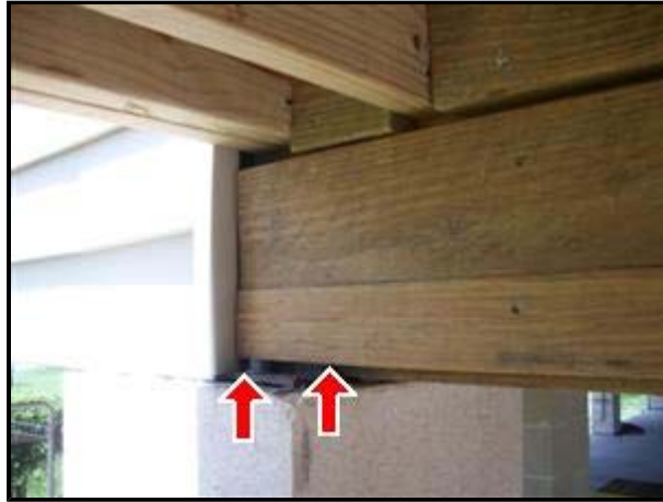
A. Picture 6

(5) Bolt at girder is not fully engaged at the rear middle pier.