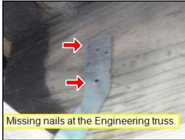
A. Picture 1

(3) Several engineering brackets are not properly installed throughout the floor joist and girder interface. They are either not completely engaged, missing or broken. These bracket should be replaced to ensure an even distribution of the load during windstorm conditions.