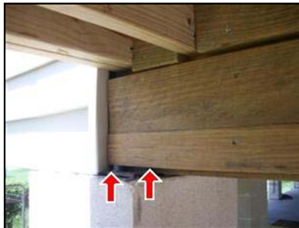
A. Picture 6

(4) There is no bracket at the rear piers. Also, the girder is not properly bolted into the pier. These bracket should be installed as per the engineered per design to ensure an even distribution of the load during windstorm conditions.