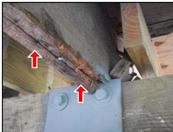
A. Picture 9

(7) Several pier along the back rows of the foundation; the girders are not properly secured to the piers. These bracket should be properly installed to ensure an even distribution of the load during