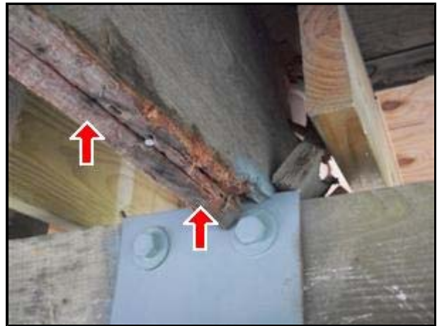
A. Picture 9

(7) Several pier along the back rows of the foundation; the girders are not properly secured to the piers. These bracket should be properly installed to ensure an even distribution of the load during windstorm conditions.