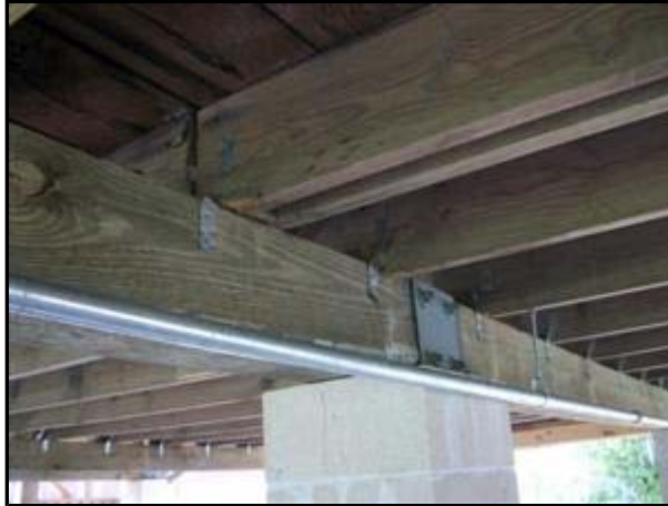
A. Picture 10